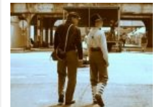
Custer Street Fair