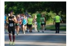
2012 N.S. 5K & Half Marathon